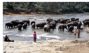
ELEPHANT BATHING PINNAWELA