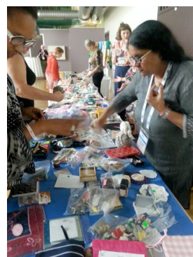
Conference attendees look for a special souvenir at the Hegg Hoffet Shop