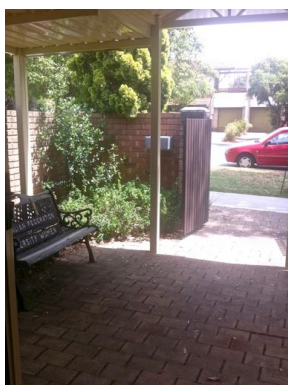
The courtyard by day.