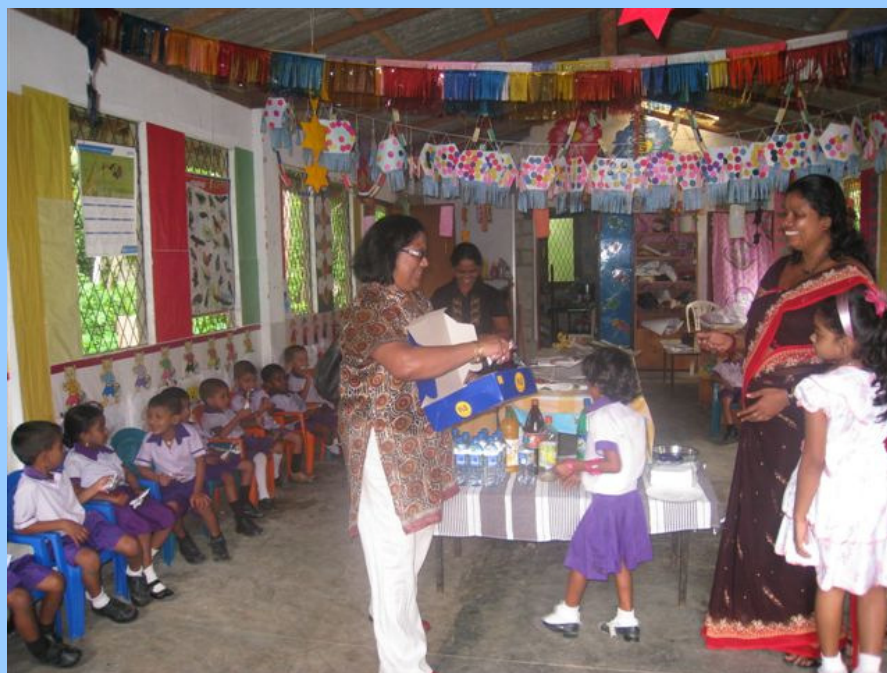
Sri Lankan Trip.....story p14