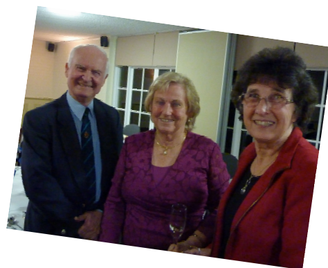
Graduate Women WA Dinner 2011