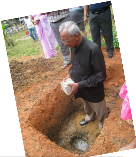
Laying the foundation stone for the Pre-School